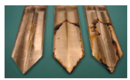
PURITY™ FG Compressor Fluid